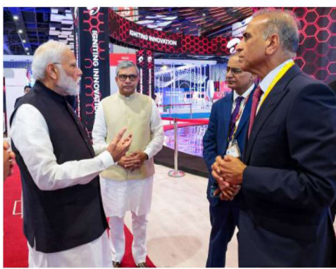
► Prime Minister Narendra Modi with Union Minister for Communications, Electronics and Information Technology Ashwini Vaishnav, Founder and Chairman of Bharti Enterprises Sunil Bharti Mittal and others at the 7th India Mobile Congress, in New Delhi,

Whether for business or relaxation come experience Our doors are open to men who desire to look their best at all times, Here men Whether need a haircut, shave or facial, "MCKINGSTOWN" offers Hygiene, professionalism and personal attention in addition offering a wide range of bespoke male grooming services tailored to their needs. Mckingstown conveniently located in Ambattur highly skilled staff elevates the traditional barbershop experience to suit the sophistication of the modern man, moving beyond basic grooming strives to offer premium quality and experience at a reasonable price that can be afforded by the every day man.