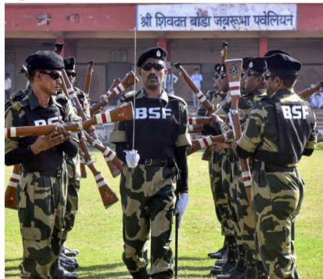
► Border Security Force (BSF) personnel perform a drill during Marwar Festival, at Maharaja Umair Singh Stadium, in Jodhpur,